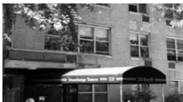
235 WEST 22ND STREET