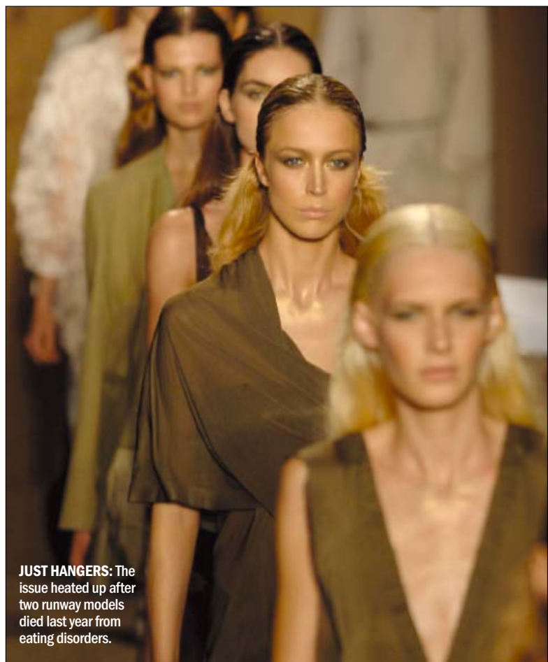
JUST HANGERS: The issue heated up after two runway models died last year from eating disorders.