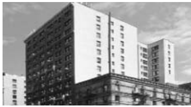
210 WEST 89TH STREET