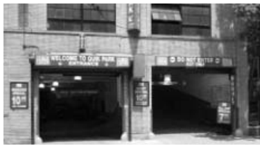
403 EAST 65TH STREET