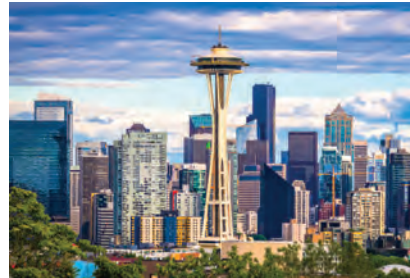
SEATTLE, WASHINGTON Serving the Pacific Northwest, P: 425-451-4950