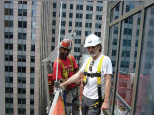
NEW YORK 2010