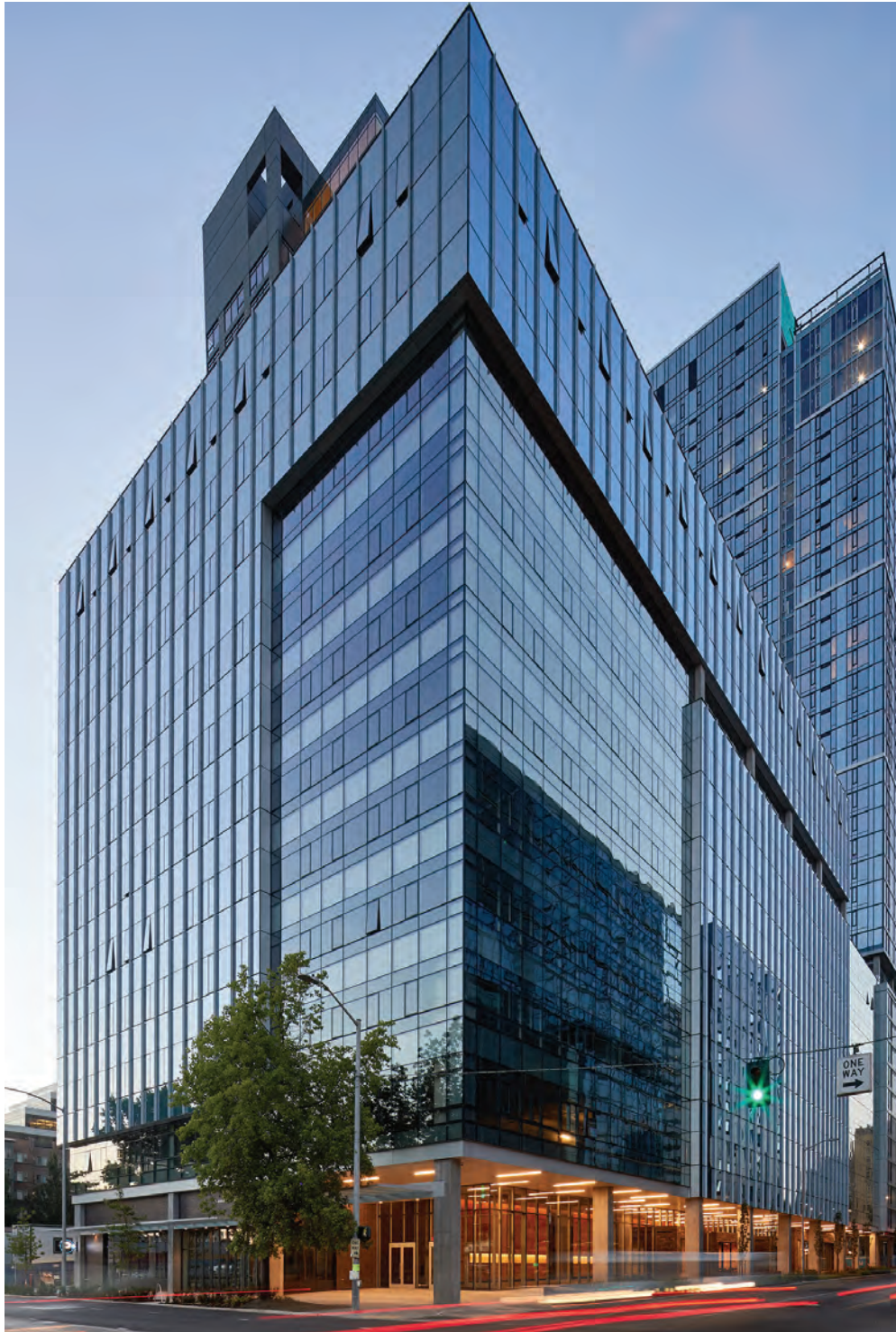
Arc Tilt 49