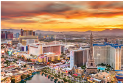
LAS VEGAS, NEVADA Serving Las Vegas and Southern California P: 702-794-4422