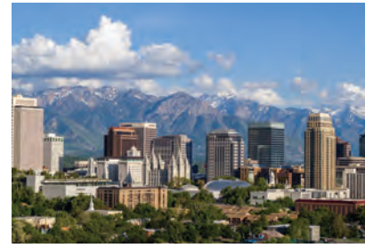
SALT LAKE CITY, UTAH Serving Salt Lake City and the Intermountain West P: 801-210-6687