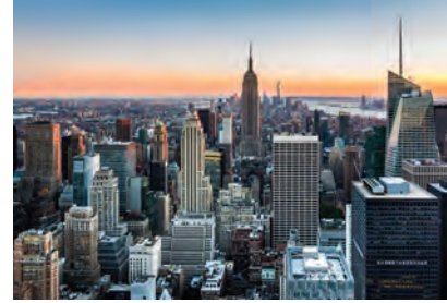
NEW YORK, NEW YORK Serving the Northeast and the North Atlantic Coast P: 212-232-0224