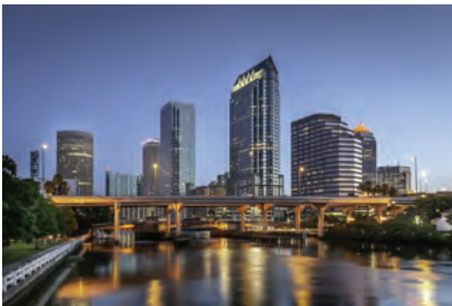
TAMPA BAY, FLORIDA Serving the Southeast and Gulf Coast P: 941-932-9060