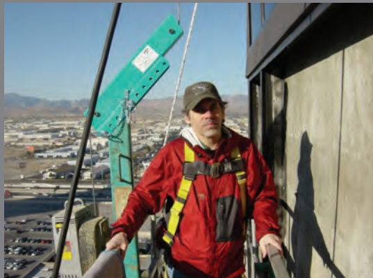
LAS VEGAS 2005