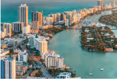
MIAMI, FLORIDA Corporate Headquarters P: 305-594-8950